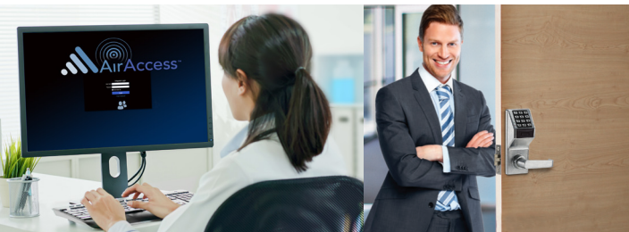
Keep in Touch Online or From Any Mobile Device